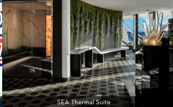
SEA Thermal Suite

Our expanded studio offers new programs like F45 classes—and sought-after classes such as The HIIT, LIT Bungee Fit, and on-demand Peloton® classes. Unlimited Class Pass available for purchase.