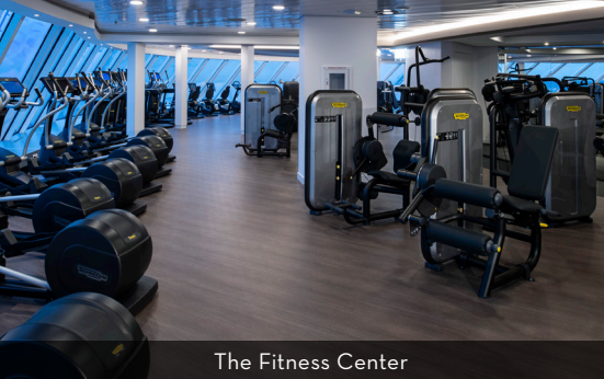
The Fitness Center